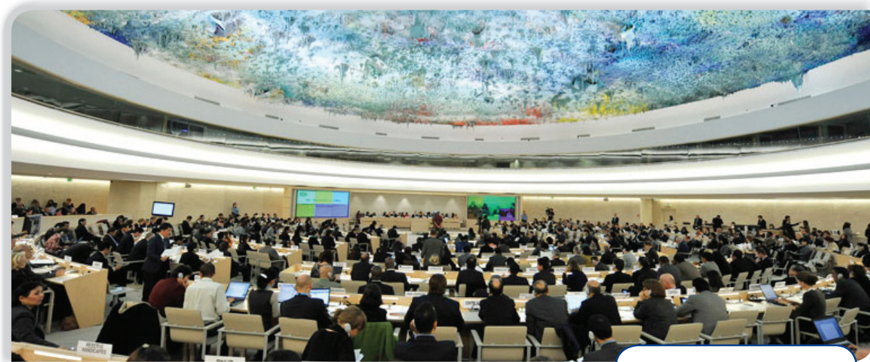
UN Human Rights Council